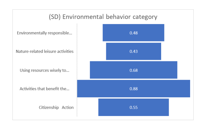
Table 1 presents each category of environmental behavior is represented by an average activity level score, as well as the overall mean score.

Each category of environmental behavior item's average activity level score and overall environmental behavior mean score.